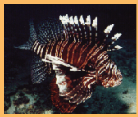
The red lion fish native to the Indo Pacific, has been sighted from New York to Florida.

Exotic species are widely regarded as one of the top threats to the maintenance of ecosystem health. They thrive in their "new" home because of a lack of predators and an abundance of prey that are ill-suited to defend themselves against the invader. When an exotic species thrives, it often competes with native species for resources such as food and shelter. This competition can result in the decline of native populations. Exotics can also introduce new parasites and diseases to the ecosystem. The U. S. Geological Survey places exotic species as the third most responsible factor for