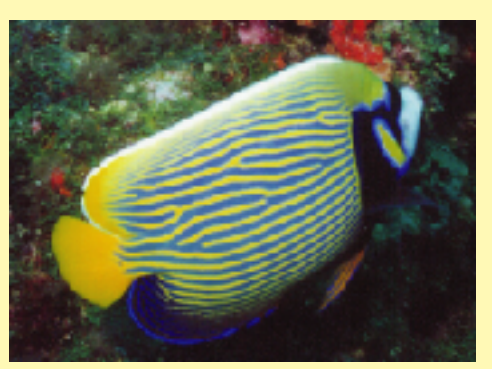
Emperor angelfish, native to the Indo Pacific has been sighted off Pompano Beach, FL.

These are all terms used to describe organisms living in areas beyond their natural range whose introduction was caused directly or indirectly by humans. It is illegal to release non-native species into state waters. Despite this, exotic species are on the rise throughout the state. This includes several species of non-native reef fishes, such as those pictured here. While they may look pretty, these fish are not welcome additions to our reefs.