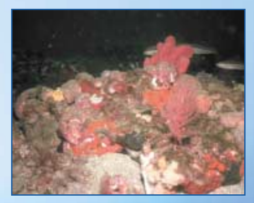
A scene from Gray's Reef live bottom reef.