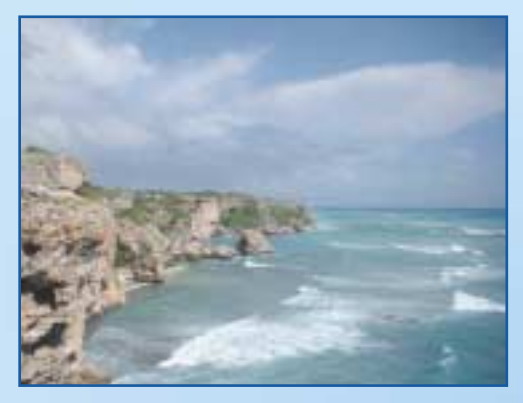
The dramatic topography of Mona Island, Puerto Rico, extends down into the water, a spectacular backdrop for diving.

REEF plans to continue working with Gray's Reef and other National Marine Sanctuaries in future AAT projects. REEF volunteers that achieve Expert status (Levels 4 and 5) are extended an invitation to be part of the AAT to participate in special opportunities such as monitoring contracts and requests to participate in research expeditions.