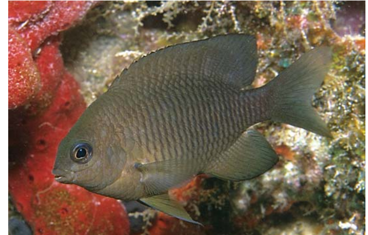
Dusky Damselfish Juvenile

SIZE: 2-4 in., max. 5 in. DEPTH: 1- 25 ft.