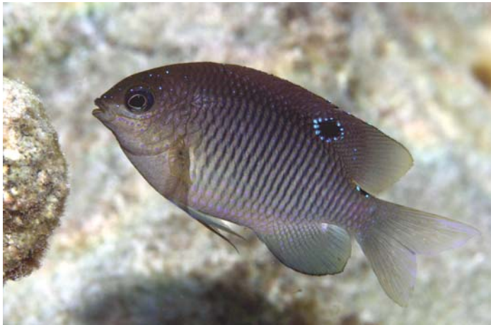
Dusky Damselfish Intermediate

NOTE: Formerly classified as species fuscus which is now considered to be a separate species, Bluespotted Damselfish, endemic to Brazil.