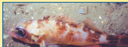
Sharpchin rockfish.

Earlier this summer, surveyors on the Pacific coast documented several sharpchin rockfish, Sebastes zacentrus . This species, normally found in deep water (330 to 990 feet), was sighted at