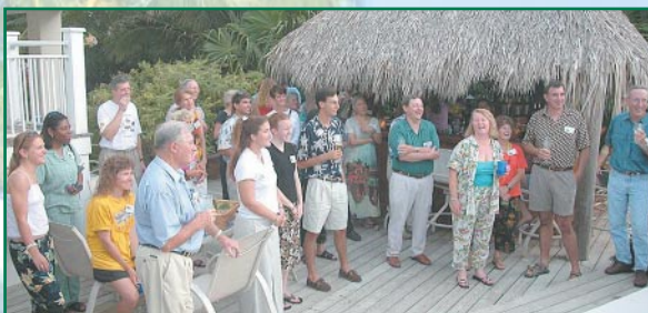
REEF members gather at the cocktail party on Friday night.

Many of the members from the very first REEF Field Survey attended and were awed to see the