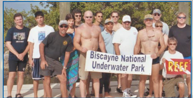
Volunteers and staff at the first annual Biscayne Underwater Park GAFC.

What do the Latin Divers Club, the PNW Critter Watchers, and the Project SEA-Link Adopt-a-REEF have in common? They were among the more than 31 organizations hosting more than 76 dive events for this year's Great Annual Fish Count (GAFC).