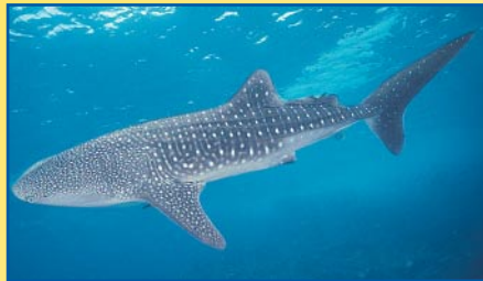
Whale sharks are the focus of a new marine reserve in Belize.

In July, the water surrounding Little Water Caye off Belize's southeastern coast was declared the newest marine reserve in an area that serves as an important spawning aggregation location for more than 25 species of reef fish and the impressive whale shark. The acquisition of the island by Friends for Nature in Belize helps to consolidate a larger marine conservation corridor in the region. Gladden Spit and Silk Cayes Marine Reserve, created in 2000, are located to the east of Little Water Caye, and Laughing Bird Caye National Park is to the west. The island will house a marine research station and ranger headquarters and will serve as the management base for the nearby MPAs. While several conservation organizations, including The Nature Conservancy and Green Reef, study the grouper and snapper spawning aggregations of Gladden Spit, Friends of Nature will focus