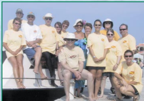
Participants in the Ambergris, Belize Field Survey 2003.

5 nights/6 days - $480 USD, includes accommodations at Highlander Motel and 4 days of 2 tank diving with Scuba Tech. Non-diver price $155 USD. *REEF Fee $100. Website: http://www.geocities.com/cbdivel/scubatech.html