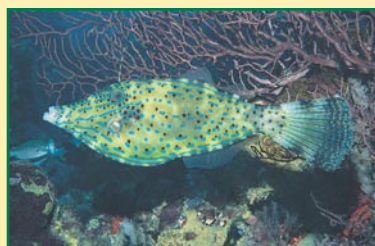
The scrawled filefish can be seen by fishwatchers in tropical oceans around the world.

(still includes CD-ROM of slides, currently only available for TWA)