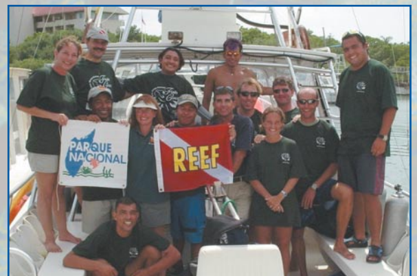
Cozumel Marine Park volunteers and staff dive for GAFC 2003.

This year's GAFC brought a festive atmosphere to many of the group projects, such as the Latin Divers Club, Cozumel Marine Park volunteers, Montego Bay Marine Park, and divers at the Stellwagen Bank National Marine Sanctuary. These and other events combined dive outings with social picnics or barbecues to make fun daylong affairs. Though final numbers were not available at press time, it appears that the hearty northeast divers at Stellwagen Bank again topped the list for single event participation with more than 74 divers conducting 110 surveys! A complete summary of press coverage and survey results will be available on REEF's GAFC website at http://www.fishcount.org . Thanks again to all the volunteers that made this event such a success.