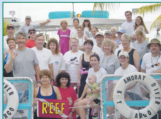
Divers prepare for a day of diving and surveying during REEF's 10 year anniversary event.

timeline created by REEF's summer interns. The timeline stretched over the walls of the Aquatic Center and vividly illustrated the growth of REEF through the years. It began with 1993 and the first survey and extended to 2003, 10 years later, with 57,663 surveys and over 25,000 members internationally. Guests were invited to fill in the timeline with their personal stories and quotes about REEF. Quotes such as "REEF brings real meaning to diving and adds excitement and enjoyment", "a passion that always brings fun underwater", and "50,000 fish geeks can't be wrong" were posted on the timeline and demonstrated the mood of the weekend.