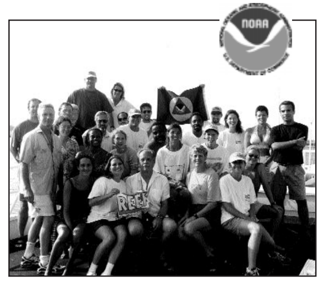
REEF and NOAA Divers Working Together