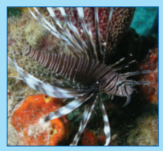
Lionfish have become established from the Bahamas to Bermuda and all along the U.S. east coast.