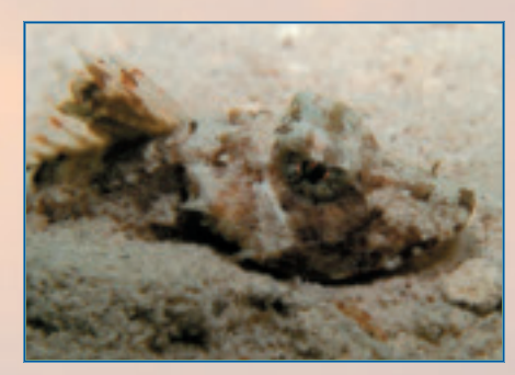
Bluespotted searobin, one of many unusual species documented by the REEF monitoring team in Biscayne National Park.

The new monitoring project will focus on sites along the sixty-foot depth boundary of the park