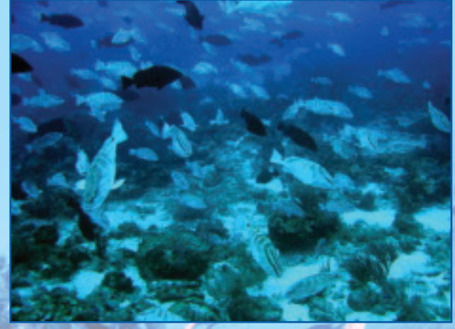
Aggregating Nassau grouper at the Little Cayman spawning site.

For more information, visit http://www.reef.org/groupermoon