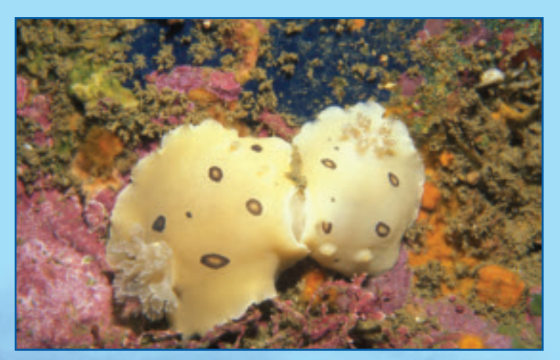
The San Diego Dorid is one of the 63 species included in REEF's new California Invertebrate and Algae Monitoring Program.

We are excited to announce that a new program is now available to REEF surveyors in California. Sixty-three invertebrates and algae, representing a broad spectrum of diversity found in California's rocky reefs, are included in the program that will serve as a companion to REEF's existing fish monitoring program in California. Orange Puffball, Spanish Shawl, and Sunflower Star are just a few of the species that are included. Why add invertebrates to a program that primarily focuses on fishes? Invertebrates such as colorful nudibranchs and sea urchins dominate the landscape seen by divers in California. Whereas tropical divers spend most of their time looking at fish seen in front of a backdrop of invertebrates, invertebrates are predominant in cold water. In addition to a desire by California REEF members to increase their survey opportunities, invertebrates can serve as valuable indicators of the health and status of a local environment. An image-based training curriculum on the species included and other training and survey materials standard to REEF's programs have been created. To find out more about this new program, visit http://www.reef.org/data/pac/inverts.htm.