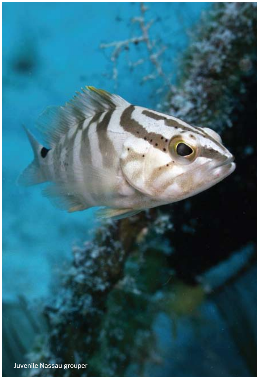
Juvenile Nassau grouper

"The Department's current position, following two decades of research, is that fishing the spawning aggregation is unsustainable and should be avoided." For more comments, visit sportdiver.com/caymanspag .