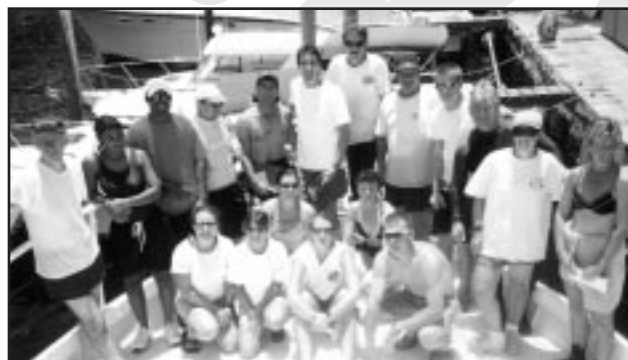
GAFC Divers - Key Largo