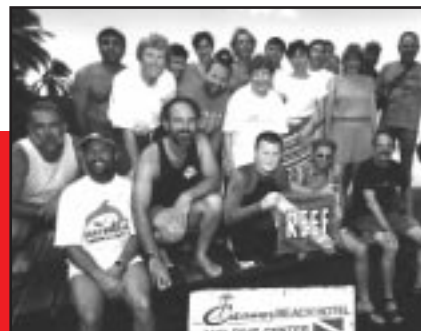
Little Cayman Group