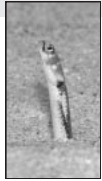
Giraffe Garden Eel, Heteroconger camelopardalis , discovered in Tobago.

just south of the equator off the coast of Brazil. Finding the species in Tobago is an amazing range extension of over 2,500 miles! Now that REEF members are aware that a third species of garden eel inhabits Caribbean waters, it will be interesting to see if the Giraffe Eel is sighted at other locations.