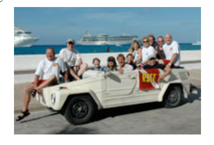
REEF's 2006 Field Survey Schedule is loaded with great destinations! Amongst many other places, we'll be returning to Cozumel again in '06. This year's trip (above) was a great time as usual!

Please consider supporting REEF and the critical work we do by donating generously this holiday season.