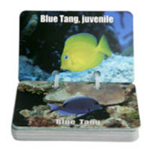
REEF now has Fish-Flips<sup>™</sup> available for Hawaii, the Caribbean, and Baja California.