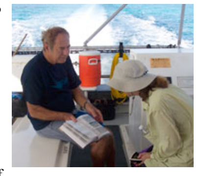
REEF Field Surveys are a great way to experience first-rate dive

REEF's Field Station of the Month is the Little Cayman Beach Resort. LCBR is an active REEF supporter recently hosting a "REEF Week" and lending diving support to The Grouper Moon Project in Little Cayman.