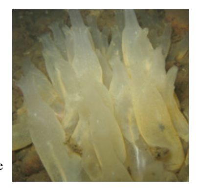
Ciona savignvi is one of

Invasion by non-native species has been ranked as one of the most devastating ecological impacts to affect marine and fresh waters. Early detection and aggressive control measures are the most efficient way to prevent wide spread ecosystem impacts from aquatic invasive species. Recreational divers are in a unique position to assist in this effort. In addition to the new tunicate program, REEF has assisted in the documentation of a hotspot of non-native fish species in South Florida and coordinated the removal of several non-native orbicular batfish from a reef in the Florida Keys National Marine Sanctuary. We are also currently working with scientists from National Marine Fisheries Service to better understand the