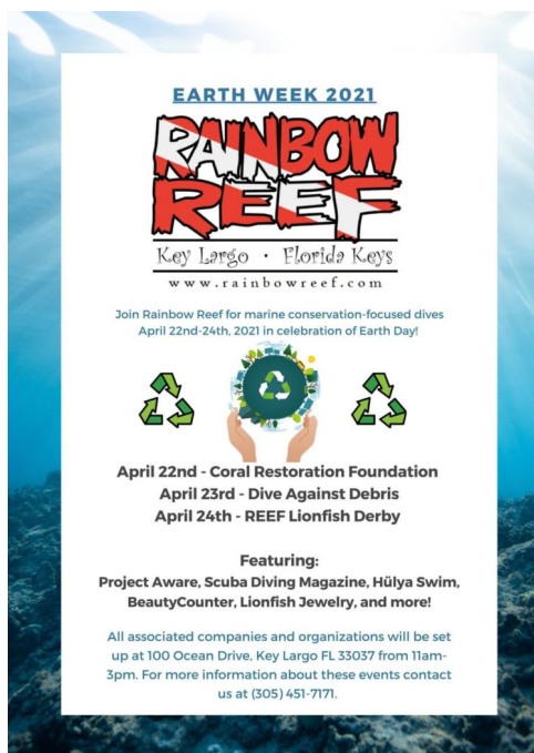
Rainbow Reef – Rainbow Reef Dive Center has a weekend of activities planned around conservation.

– Reservations required for all dives. Call Rainbow Reef at 305-451-7171.