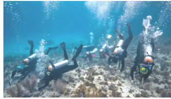
On Friday and Saturday, June... June 2, 2019