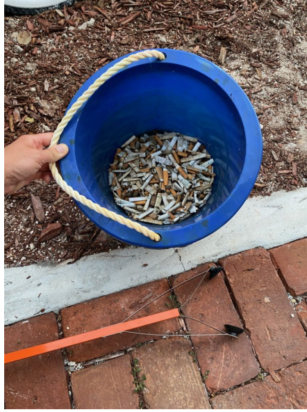
Reef Relief's cigarette collection contest will end on Earth Day. Bring cigarettes to the center for tallying.

2. Apr. 22, 5 p.m. at the Coffee Butler Amphitheater – Earth Day Jam with That Hippie Band: “It will be like Woodstock without the mud.” Celebrate the glorious 51st Earth Day with Key West’s own fugitive band of Hippies from the '60s. Local nonprofits Reef Relief, Conch Republic Marine Army and the Key West Parrot Heads will be there to join band members in celebrating the planet. as they help you remember all the songs from when the environmental era first began: The Beatles, Grateful Dead, Rolling Stones, Jefferson Starship, Crosby, Stills, & Nash and more. Wear some Hippie clothes, get back into the groove with The Beatles, Rolling Stones, Grateful Dead, and more.