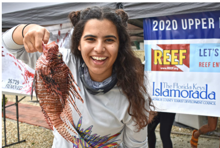
REEF will host it's 8th Annual Lionfish Derby over Earth Day weekend. Divers will collect invasive lionfish off local reefs.

4. Apr. 23 at 8 a.m. at Publix (101437 Overseas Hwy., Key Largo) – Community Cleanup: Meet at Publix for a community cleanup. Starts at 8 a.m. Gloves, sanitizer and other supplies will be on hand. Please bring a mask. For more information, contact mailservice@dacdb.net .