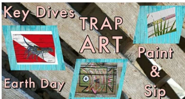
Key Dives will host a paint & sip using upcycled marine debris on Apr. 22.