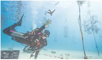
Citizen-science experiences educate and amuse August 11, 2020