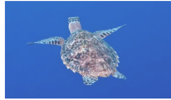
DIVE REPORT: WINDY EARTH DAY WEEKEND? April 22, 2021