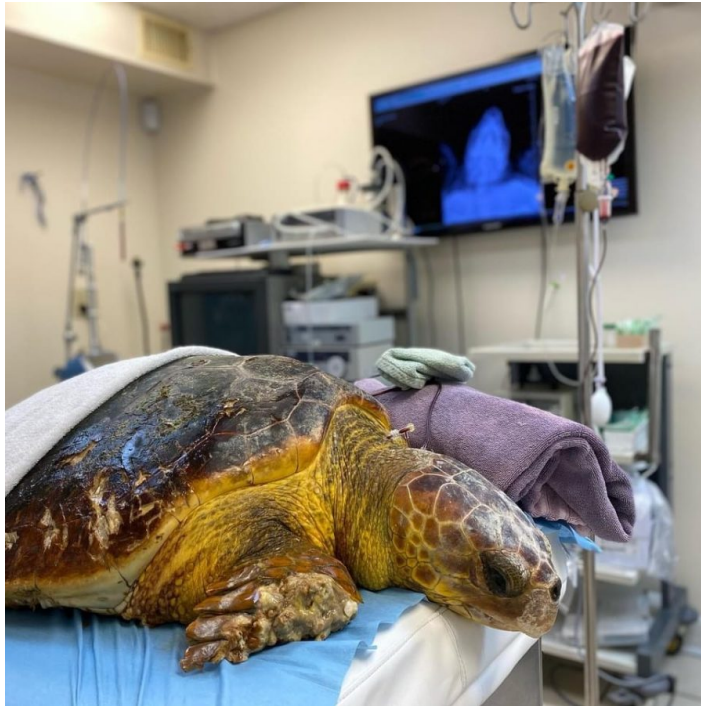
Sparb will be released from Sombrero Beach on Earth Day.

1. Apr. 22, at 9 a.m. at Sombrero Beach in Marathon – Turtle Release: The Turtle Hospital in Marathon will release Sparb, a sub-adult loggerhead sea turtle that was rescued off Sombrero Beach at the end of January. She was in critical condition and not expected to survive, but has miraculously made a full recovery. Now, she's ready to return to her ocean home. Join us at Sombrero Beach at 9 a.m. to celebrate her recovery. She will be released at 9:15 a.m. sharp.