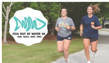
REEF Hosts Inaugural Virtual 5K Supporting Ocean Conservation August 24, 2020