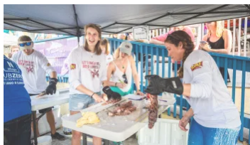
Lionfish Derby at Postcard Inn set for Sept. 13-15 August 30, 2019