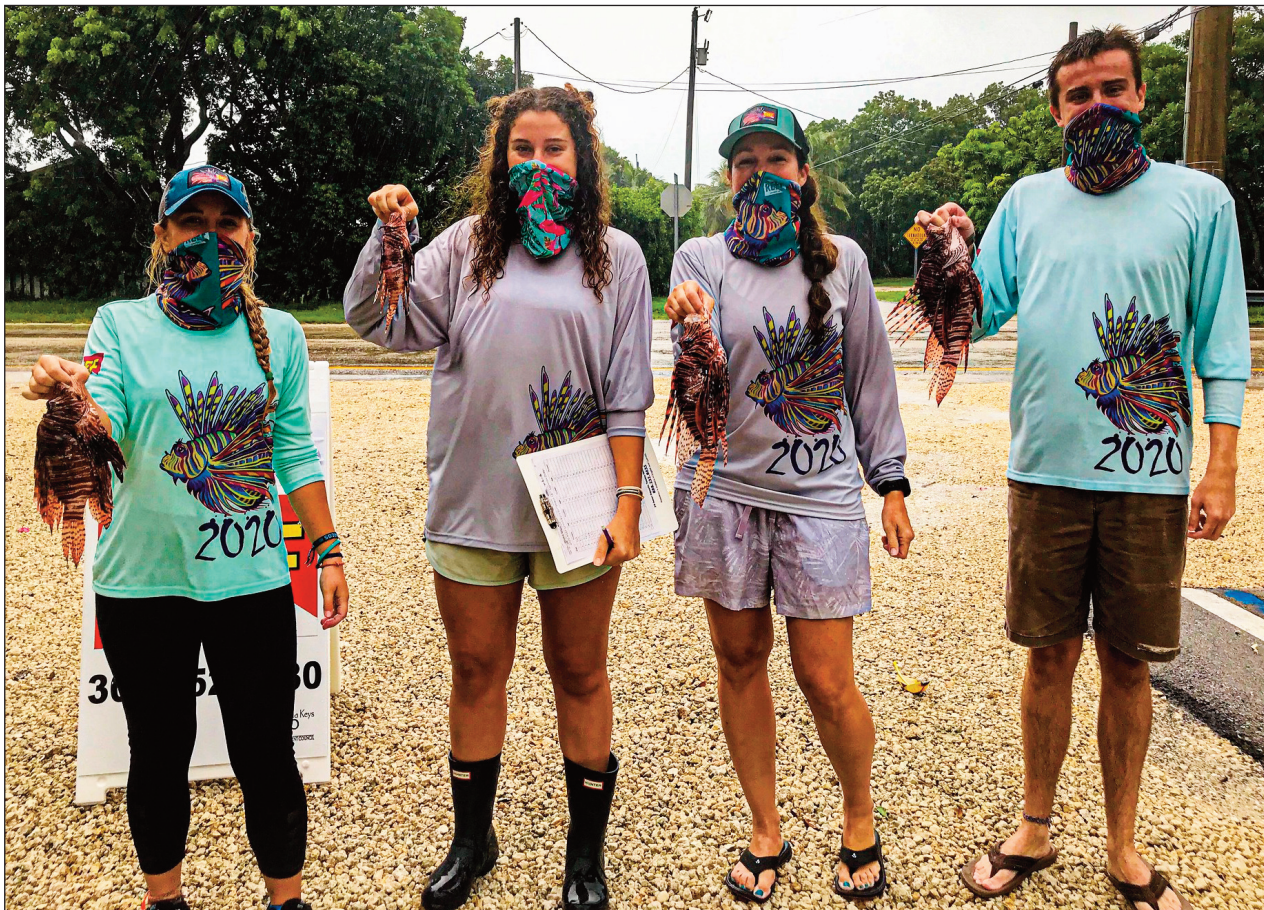
Teams who sign up for the Earth Day Lionfish Derby, April 23-25, 2021 are hoping for as large a take as from the September 2020 event.

Another 2020 innovation was their first ever, REEF’s Fish Out of Water Virtual 5K, held during the period of September 28 - October 4, 2020. They had 497 participants from 37 states and 8 countries who ran, walked, biked, or hiked to complete more than 1,540 miles. With that kind of response, the staff set a goal for an annual Fish Out of Water Virtual 5K to coincide with World Oceans Day (June 8) each year. Registration is now open for the event to be