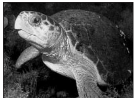
The loggerhead sea turtle is one of six sea turtles found in the Caribbean, and one of the most likely to be encountered by REEF surveyors. It is distinguished by its large head and the somewhat humped, reddish brown shell.

Modified version of the sea turtle identification card. Visit www.reef.org/data/seaturtle.htm to download the complete product.