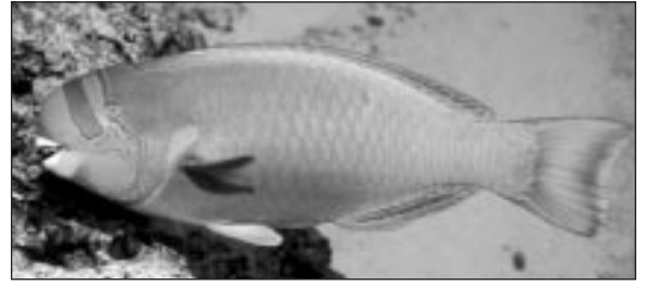
Hawaii's spectacled parrotfish.

While Hawaii may only have half the number of parrotfish species as the Caribbean, its cultural affinity to the uhu certainly makes up for the reduced diversity! What's more, the uhu are arguably the most conspicuous and charismatic of Hawaii's reef fish, since the Hawaiian angelfishes are typically smaller and less impressive visually than their Caribbean counterparts. Hawaii's seven species of parrotfishes are the Stareye, Bullet-