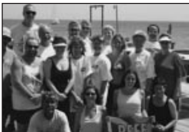
REEF's Field Survey to Utila in June 2001.

Visit the online Field Survey Log to read past trip reports: www.reef.org/member/forum/fslog.htm