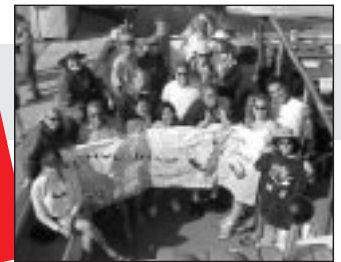
GAFC participants on their way to do a fish survey in new areas within the Channel Islands National Marine Sanctuary.

July. Not true!!! REEF needs dedicated fishwatchers all year round! So, while you're waiting for the next GAFC to come around, attend a REEF fish ID seminar, practice your fish-watching skills, keep doing surveys and join us next year!