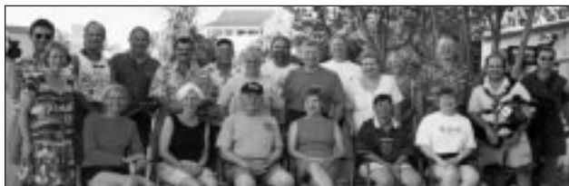
REEF's Discovery Tour to Bonaire in July 2001.

Field Stations are instrumental as a center for dissemination of REEF information and materials. Field Stations regularly promote and teach Fish Identification Courses, organize dives built around fish watching and taking surveys, promote REEF membership, and serve as a distribution center for REEF materials and survey forms.