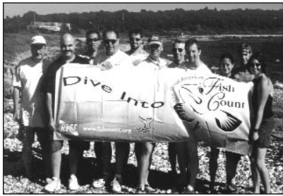
Members of The New England Aquarium Dive Club participated in a GAFC Challenge dive at Fort Weatherill, located in Jamestown, Rhode Island.

tioned GAFC dive events were entered into a grand prize drawing. Sponsors for the Grand Prizes included REEF Field Stations: Southern Cross Club on Little Cayman, www.southerncrossclub.com , and Aqua Safari, www.aquasafari.com , in Cozumel, Mexico.