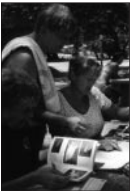
Volunteers for the Hawaiian Islands Humpback Whale National Marine Sanctuary complete REEF's survey scan forms after their GAFC dive.