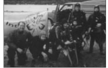
Volunteers from the Poulsbo Marine Science Center survey at Point White Pier on Bainbridge Island, WA.

To learn more about the REEF Fish Survey Project visit www.reef.org .