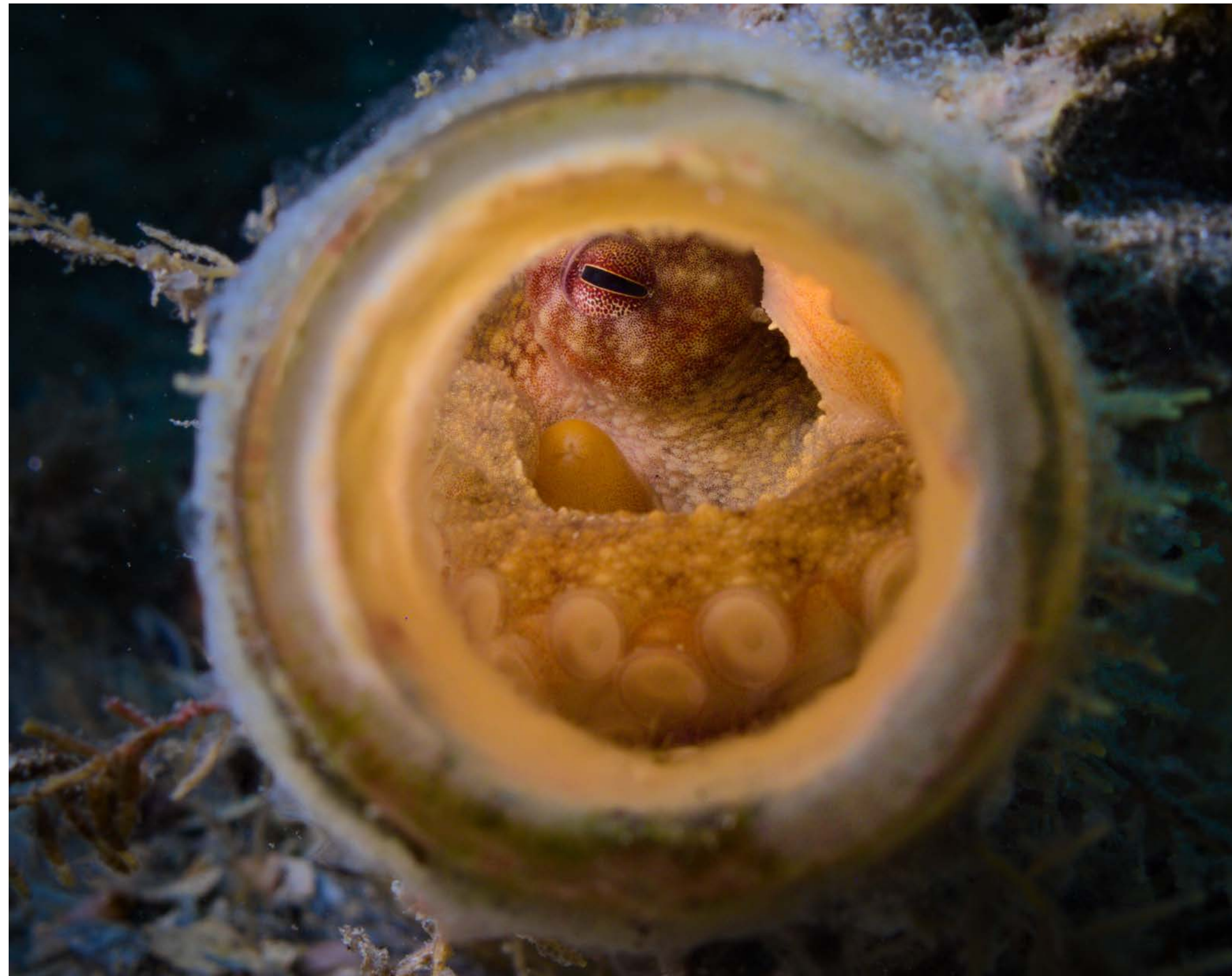
Professional Vote: "Octopus in a Bottle" by Marinano Asselborn Photographed in Riviera Beach, Florida