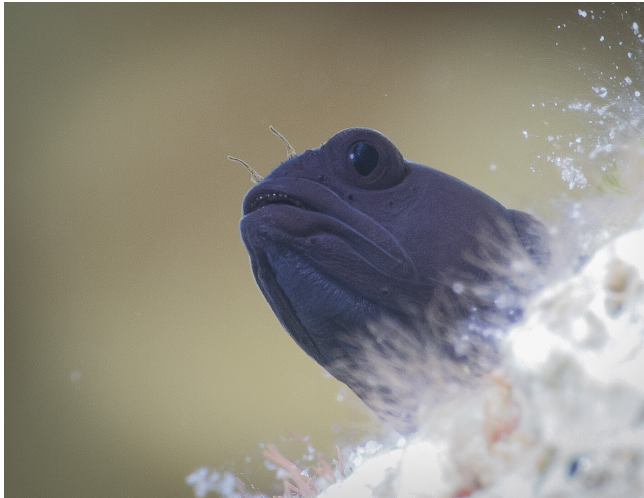
REEF Vote: "Southern Smoothhead Glass Blenny" by Alev Ozten Low Photographed in Bonaire