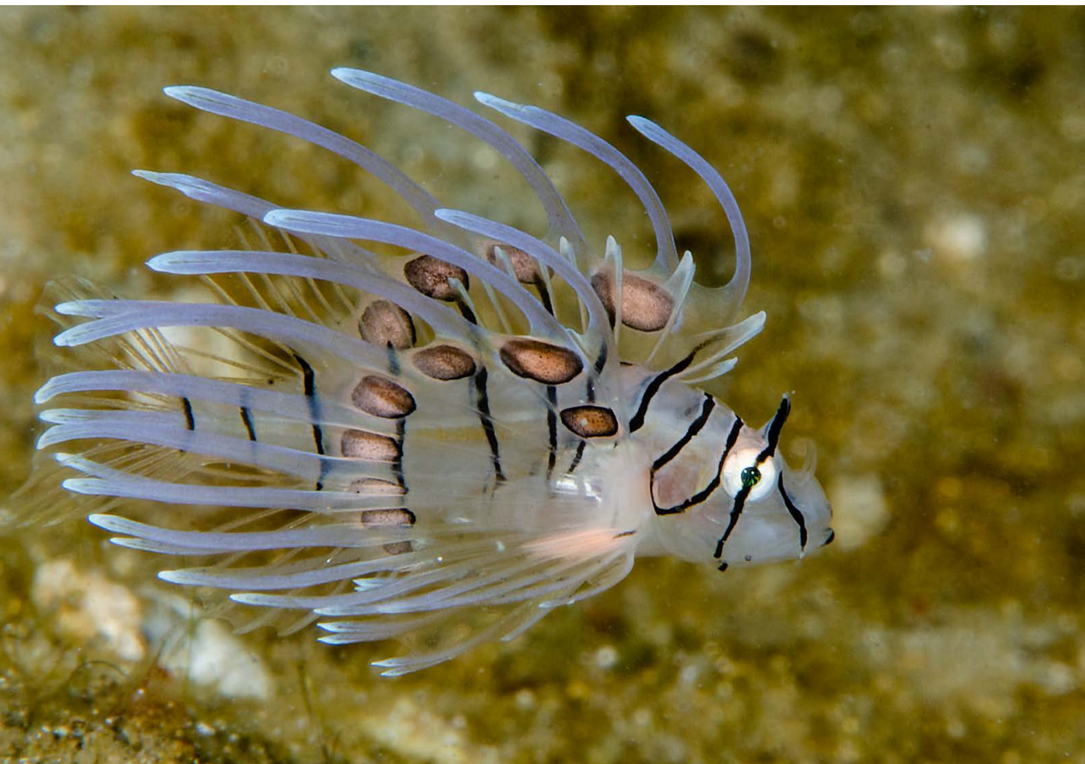
Popular Vote: "Lion Cub" by Jeff Haines Photographed at Blue Heron Bridge, Florida