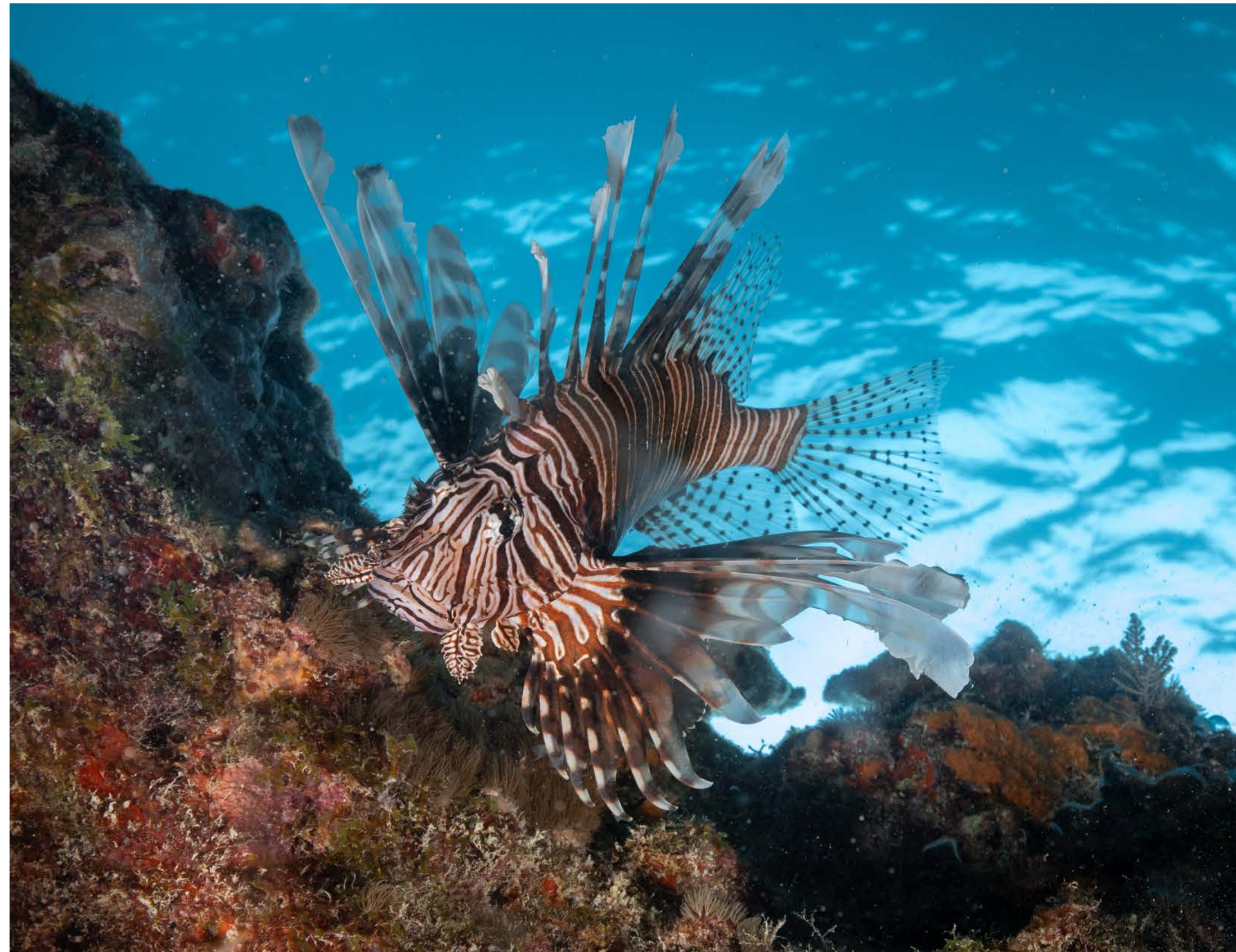
REEF Vote: "Upside Down" Photographed in Florida Keys