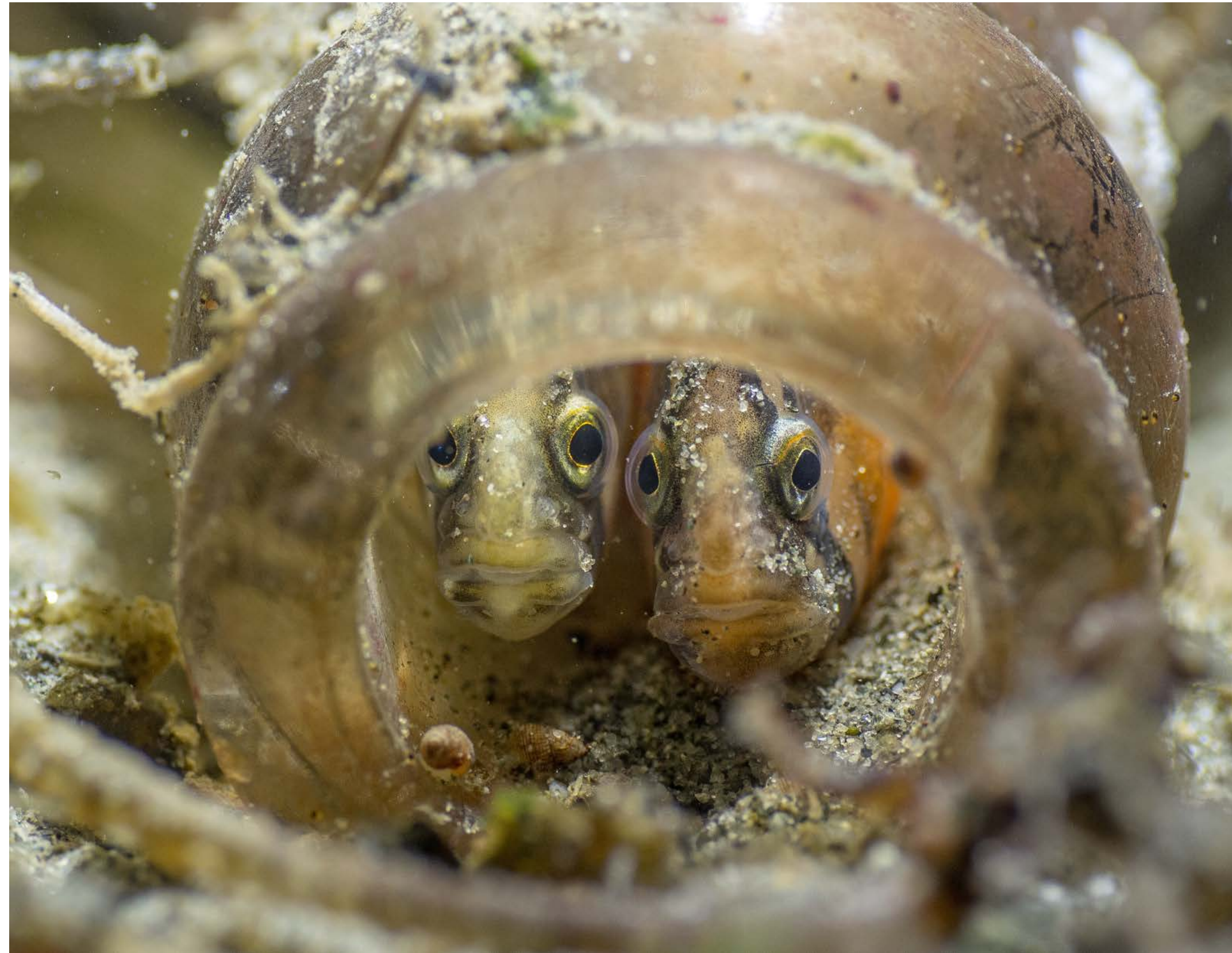
Professional Vote: "He's Still Out There Marge" Photographed in Hood Canal, Washington