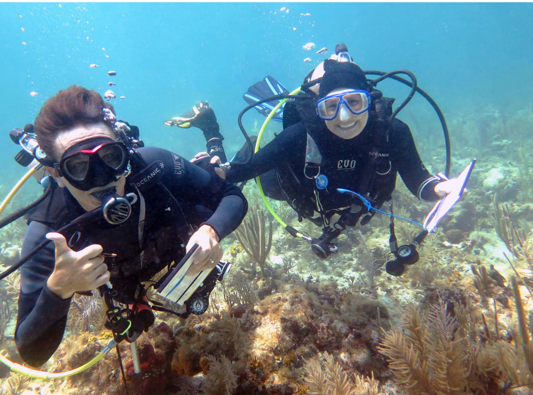
Professional Vote: "REEF Surveyors" by Daryl Duda Photographed in Florida Keys