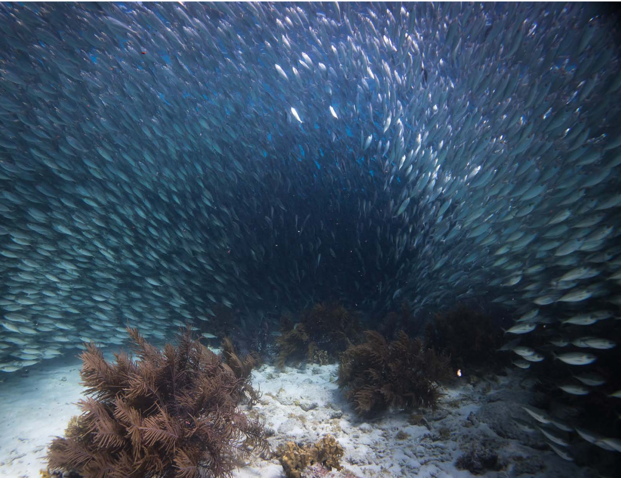
Popular Vote: "Baitball Time Warp" by Alev Ozten Low Photographed in Bonaire