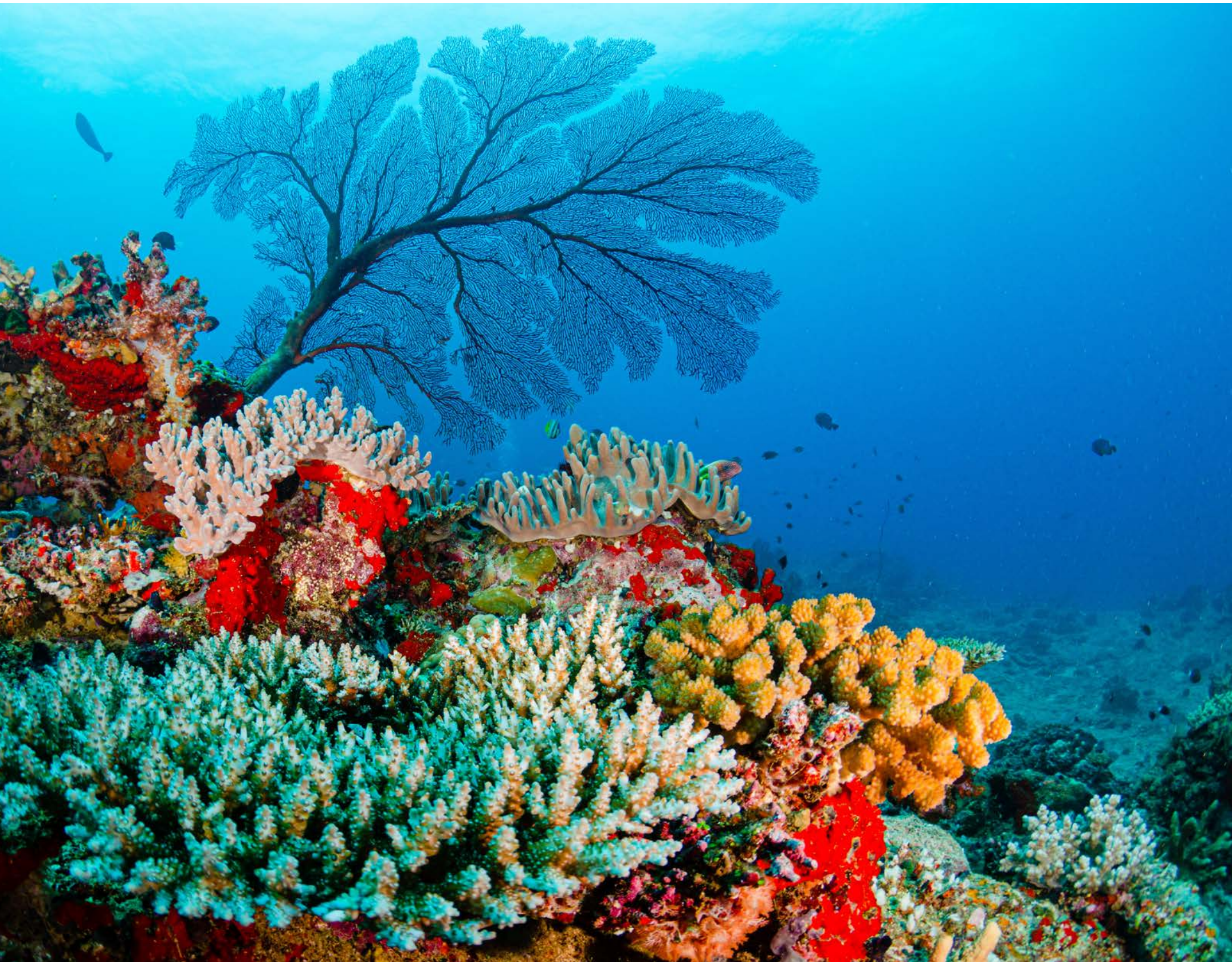
REEF Vote: "HardnSoft" by Jeff Haines Photographed in Fiji