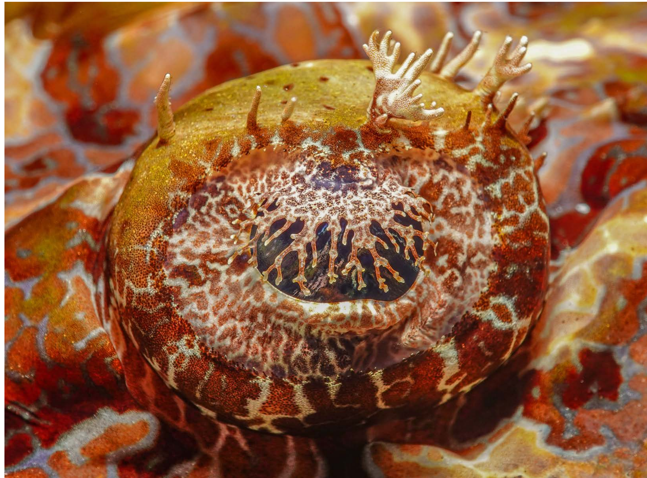
REEF Vote: "Crocodilefish" by Marie Kearney Photographed in Solomon Islands