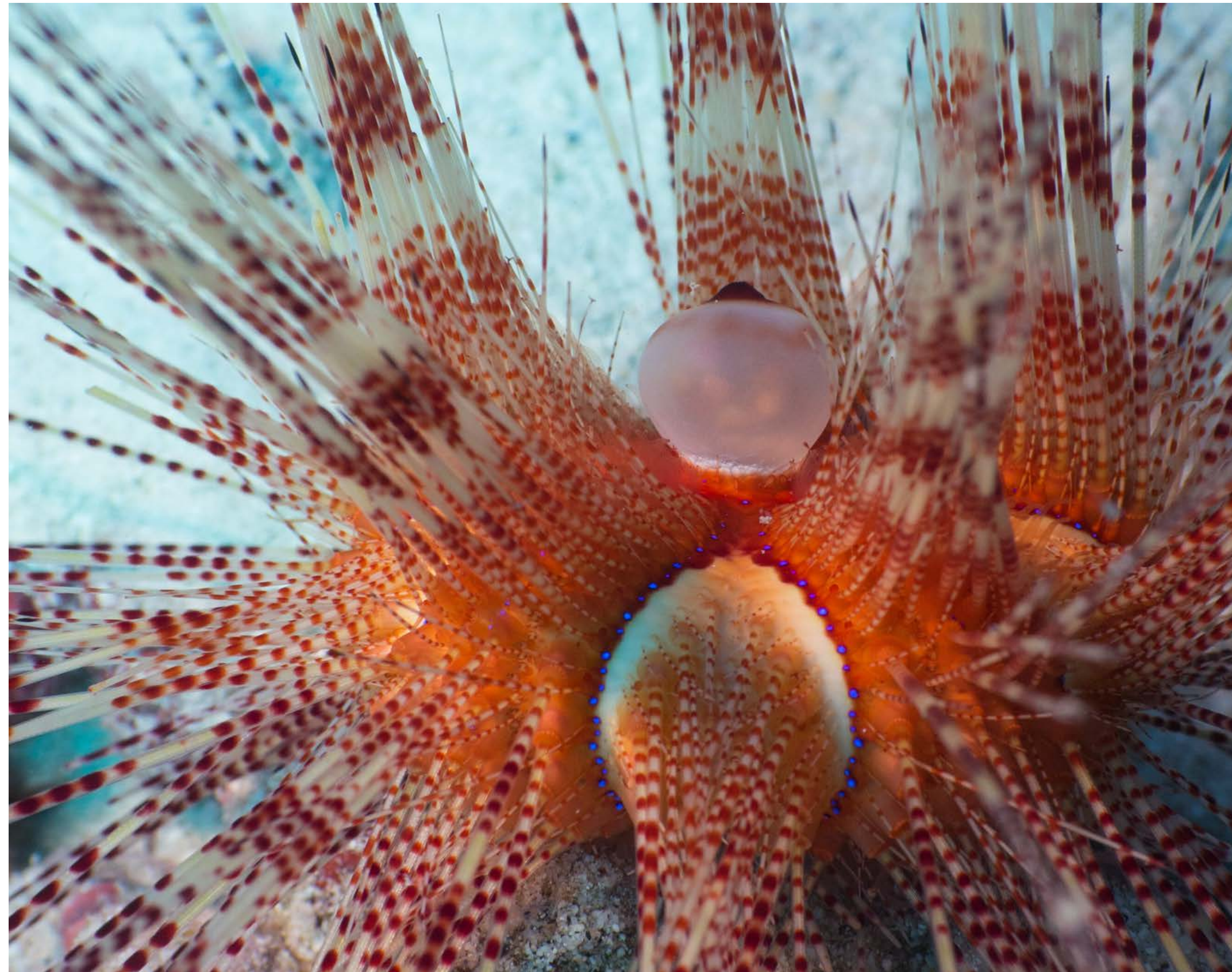
Popular Vote: "Magnificent Sea Urchin Juvenile" by Alev Ozten Low Photographed in Bonaire