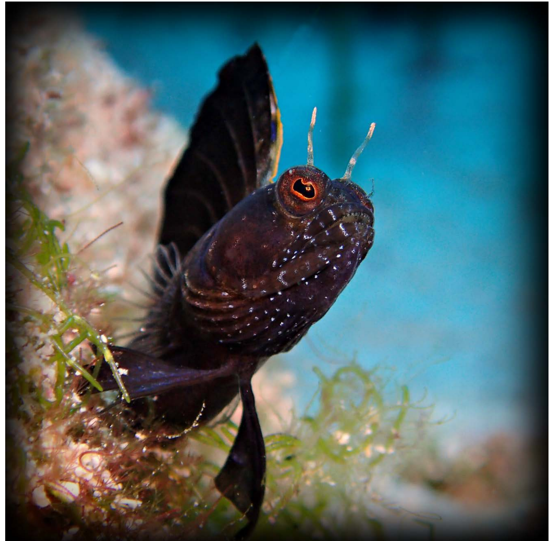
REEF Vote: "You Looking at me?" by Dottie Benjamin Photographed in Little Cayman