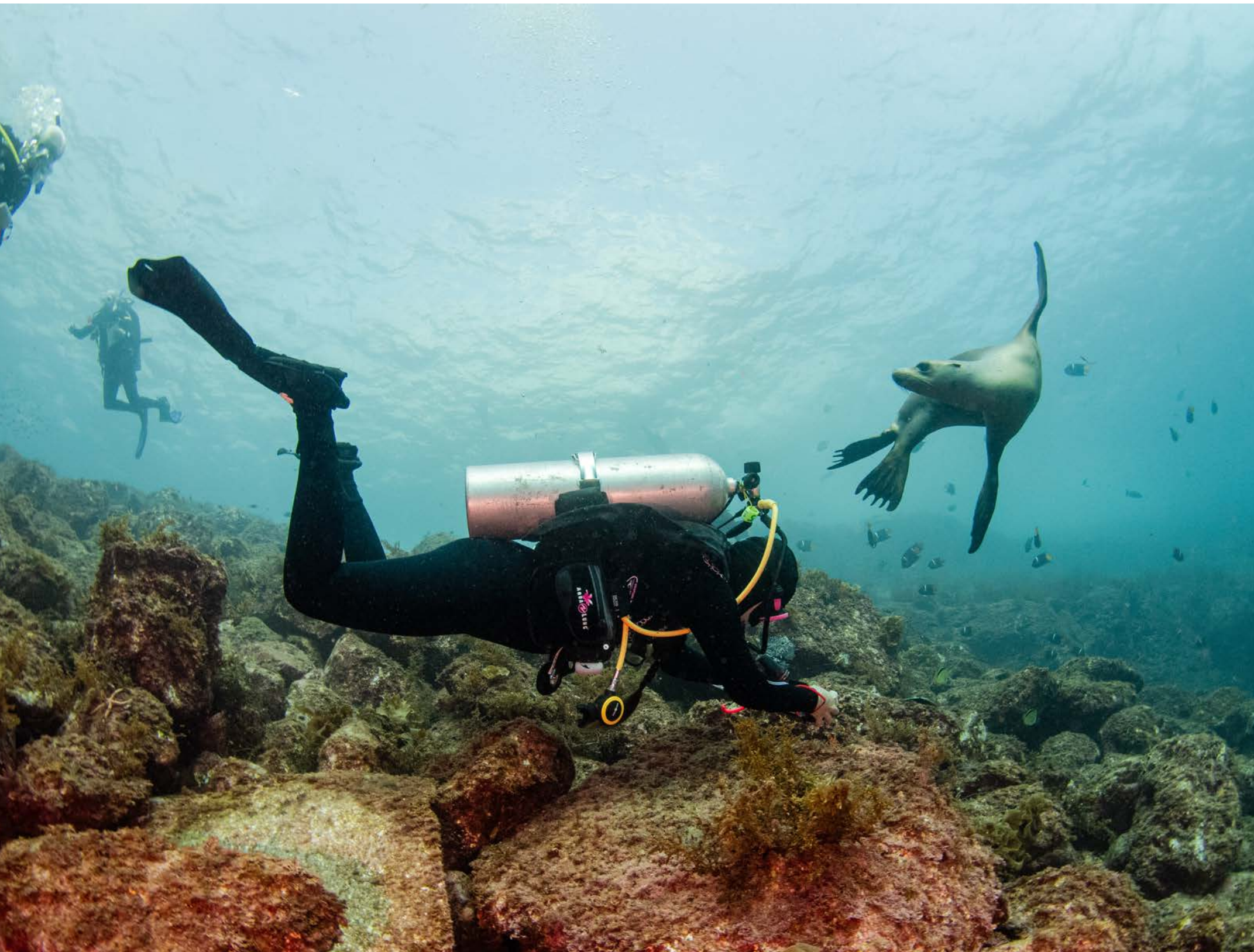
REEF Vote: "Mammals Don't Count" by Jeff Haines Photographed in Sea of Cortez