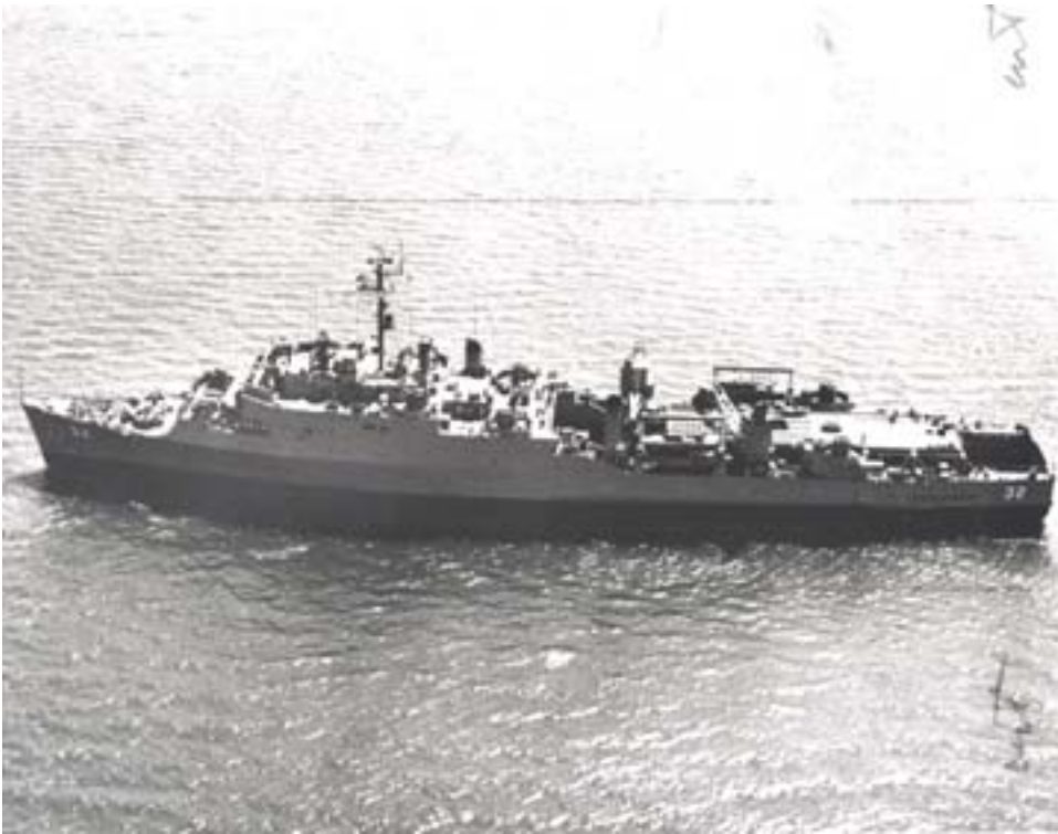
Figure 1a. The Spiegel Grove during its service years.