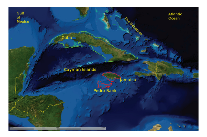
FIGURE 1: Map of the northern Caribbean Basin showing regions covered in this paper. Outlines around each region, the Cayman Islands, Cuba, and Jamaica, trace the 100-meter depth contour around each island or group of islands, within which all reef sites used in this study are included. Cyan colour: Cayman Islands; green colour: Cuba; red colour: Jamaica. The region outlined in red, but disconnected from the island of Jamaica, represents Pedro Bank.

secondary extinction of a species if it loses all its incoming paths, that is, its prey resources, as a consequence of an initial extinction. Topological extinction thus measures the structural robustness of a food web [13], but it is limited to a minimum estimate of secondary extinction because it functions only in the direction of energy flow (bottom-up) [14]. A further limitation is imposed by the typical lack of demographic parameters in complex food web networks (but see [15]), forcing one to ignore demographic changes that could result from the initial extinction(s), such as top-down trophic cascades and Allee effects. Nevertheless, parameter modeling can indicate the potential for demographic instability and tipping points in the community.